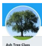
Ash Tree Class

Parents can now keep up to date with learning activities by following the class Twitter feeds: