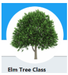
Elm Tree Class