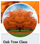
Oak Tree Class