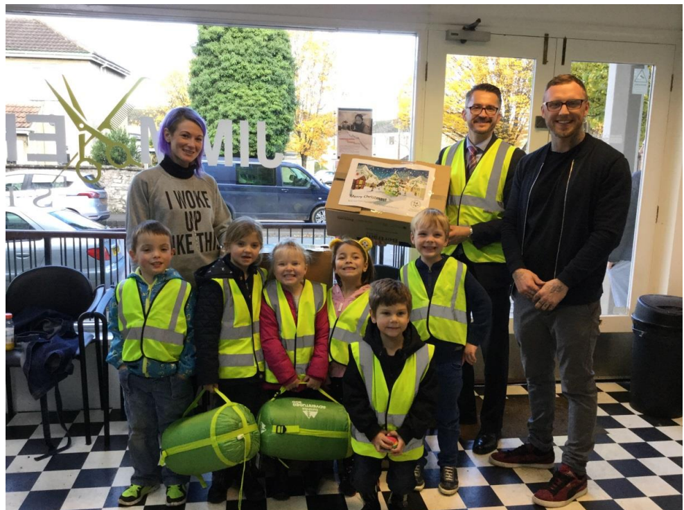
Members of the school's Community Action in Twerton (CAT) Team delivering our Christmas gift boxes for the Homeless in Bath and Bristol to Jimmer's Barber shop.