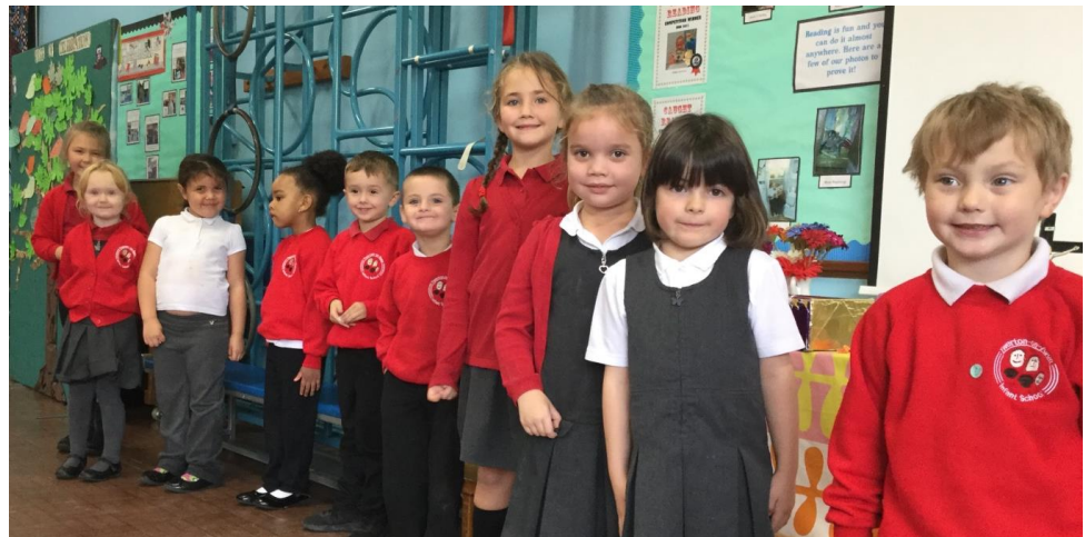
Well done to the 10 recipients of Leaves from Friday's Celebration Assembly.