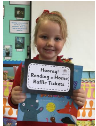
Last week's proud leaf recipients and Reading Raffle Prize Winner

The school's SMS number has changed to: 07786 201170